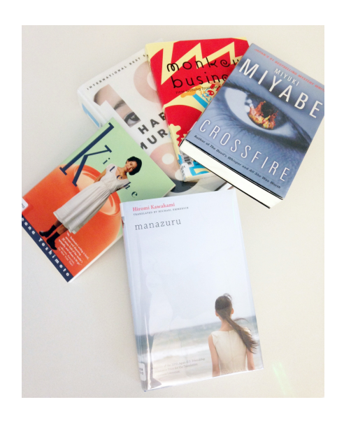
Date: Wednesday, March 4, 7PM